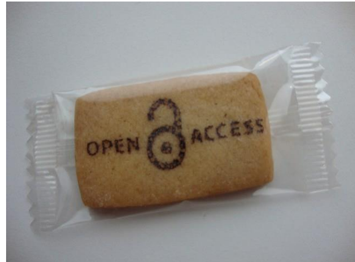
Open Access Cookie. CC BY-NC-SA 2.0 DE. © bibliotekje